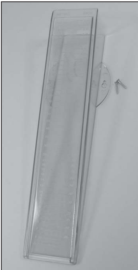
200-2530 Fence Post Rain Gauge